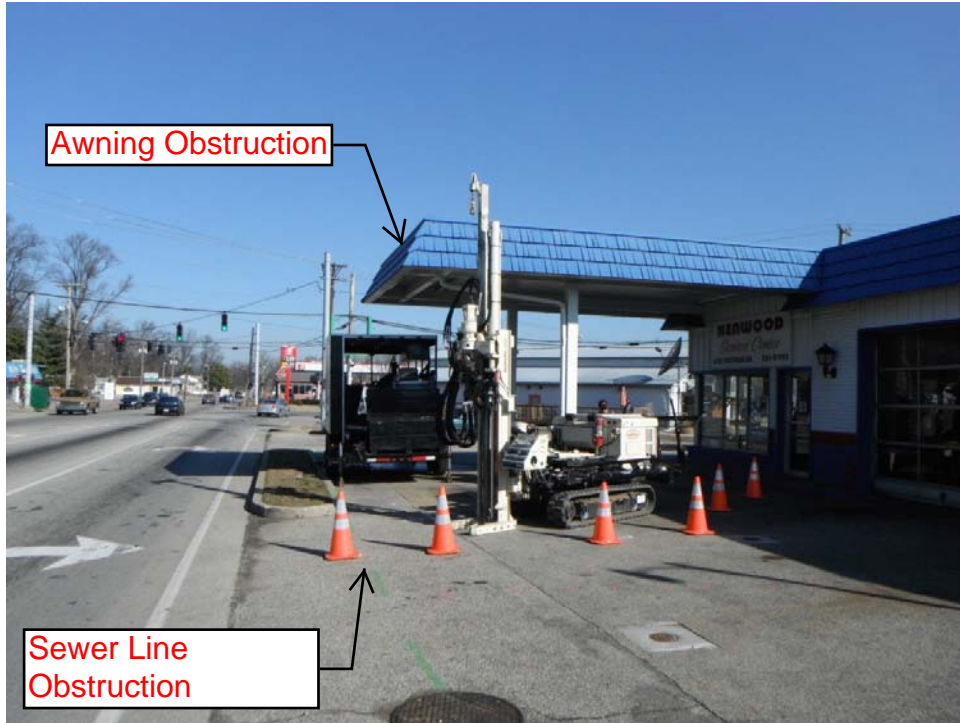
Photo 1 – Driving to inject, Geoprobe® in foreground and injection trailer in background. 02/12/13